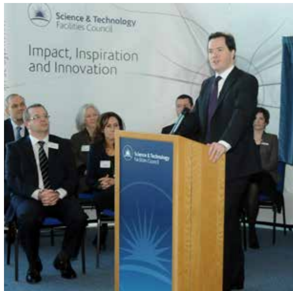
Chancellor of the Exchequer, George Osborne MP officially opens the Hartree Centre at Daresbury Laboratory

STFC's Hartree Centre is a research collaboration with IBM, the world's biggest IT and consulting services